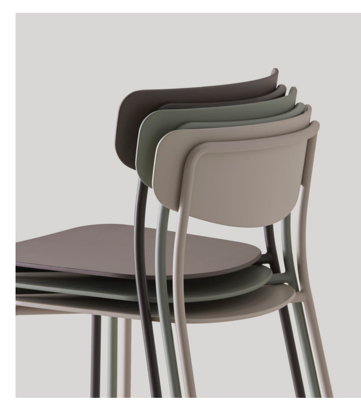
Lea seats and backrests are also available in a wide range of plastic colours and can be matched with the structures to create elegant monochromatic pieces.